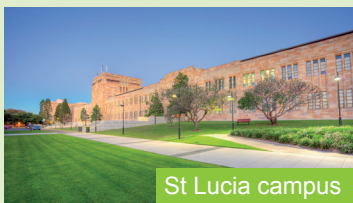
St Lucia campus